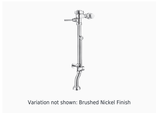
Variation not shown: Brushed Nickel Finish